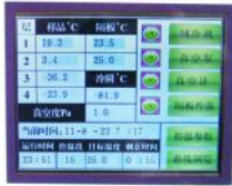
液晶触摸屏 LCD touch screen