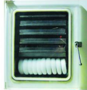
透明有机玻璃门 Colorless organic glass