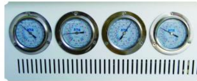
压力表 Pressure meter